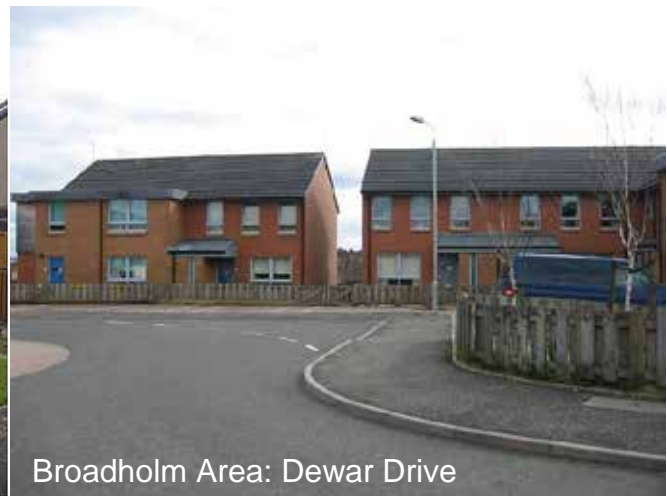
Broadholm Area: Dewar Drive