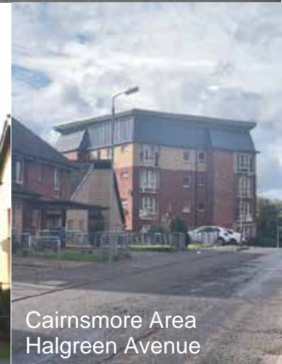
Cairnsmore Area Halgreen Avenue