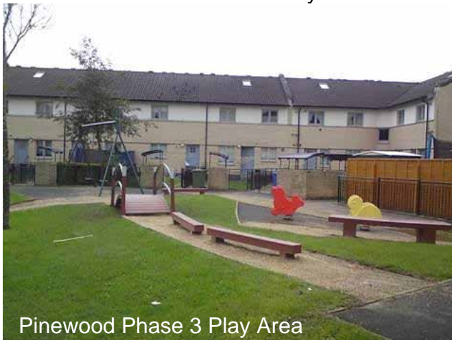
Pinewood Phase 3 Play Area

Of all the tenants asked during the 2020 tenant satisfaction survey about their satisfaction with the quality of their home, only 5 tenants advised that they were dissatisfied. If you are a tenant in one of our properties and you are not satisfied with the quality of your home, please let us know so we can review this with you.