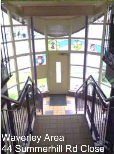
Waverley Area 44 Summerhill Rd Close