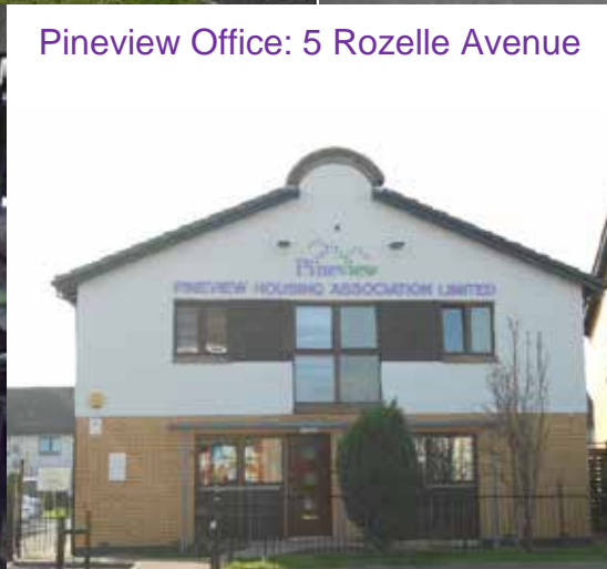
Pineview Office: 5 Rozelle Avenue